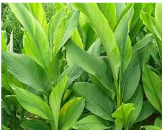
Fig. 9. Curcuma longa

Curcuma longa belongs to Zingiberaceae family, also known as haldi. Curcuma longa possess various therapeutic aspects such as anti-depressant, anti-cancer, hepatoprotective, anti-tumor and anti viral [38]. Extracts of Curcuma longa as aqueous reported antidepressant activity in reduction of brain monoamine oxidase type A [39].