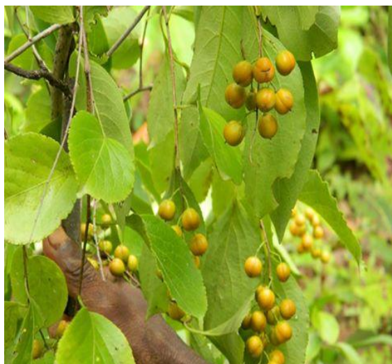
Fig. 8. Celastrus paniculatus

seed extract of Celastrus paniculatus improves memory and cognitive function. This plant has shown antiarthritic and antioxidant effects in rat model [37].