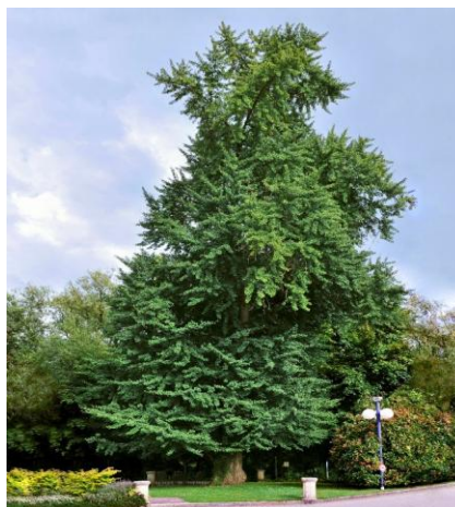
Fig. 2. Ginkgo biloba

improves behavioral modification for memory enhancement. In vitro study has shown that extract of ginkgo has anti amyloid effect [27]. This extract also believed to increases transthyretin RNA levels which is a part of beta-amyloid transport mechanism that inhibits further amyloid deposition in brain [28].