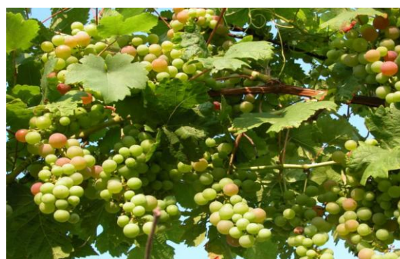
Fig. 11. Vitis vinifera

Aerial parts of the plant Vitis vinifera have been used in Ayurveda system for the treatment of various stress related disorders [40]. The extract of the seed part of Vitis vinifera was evaluated for antistress activity in stress induced rats and normal rats [41]. The methanolic resin extract of Vitis vinifera at a dose of 30 mg/kg significantly exhibit nootropic activity in elevated plus maze and in passive shock avoidance [42].