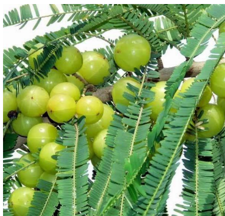
Fig. 4. Emblica officinalis

evidences that shows their memory enhancing effects and has been demonstrated as effective cure in the Alzheimer's disease management. Therefore amla acts as potent memory enhancer that ascribe to its quality of reducing brain cholinesterase activity [32].