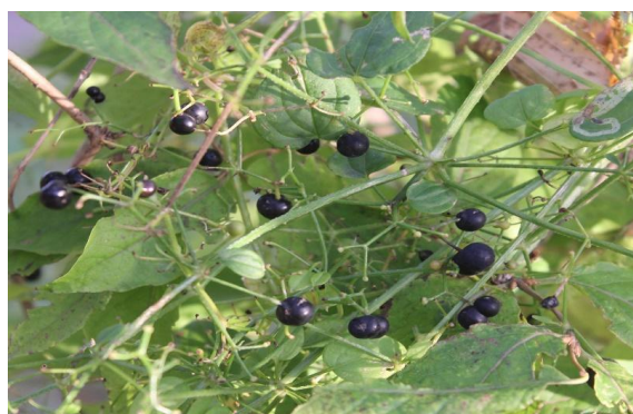
Fig. 14. Rubia cordifolia

Rubia cordifolia is also known as Indian madder. Alcoholic root extract of Rubia cordifolia possess the enhancement in brain gamma-amino-n-butyric acid (GABA) levels and decrease in plasma corticosterone and brain dopamine levels. Scopolamine induced learning and memory impairment are also antagonised [45].