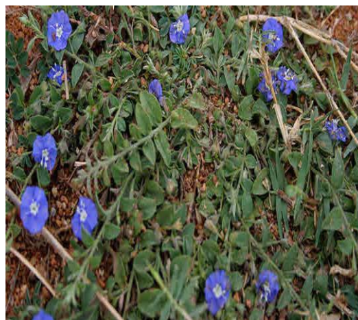
Fig. 6. Evolvulus alsinoides

.This herb is used as nootropic as it possesses memory potentiating, anxiolytic and tranquilizing properties. In a study this has been claimed that various extracts of Evolvulus alsinoides improves learning an memory in rats [34].