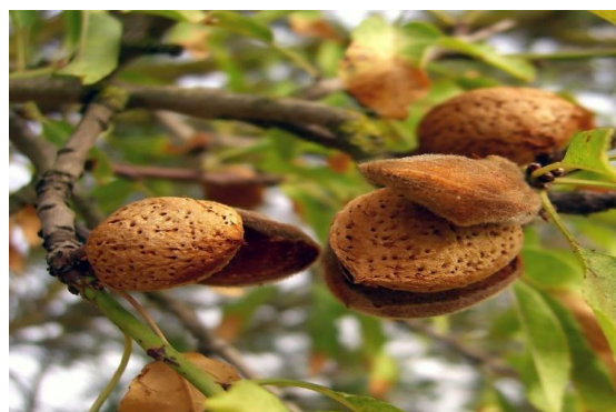
Fig. 10. Prunus amygdalus

like memory and learning, total cholesterol levels and cholinesterase activity were determined using elevated plus maze [40]. In rats Prunus amygdalus reduced the brain cholinesterase activity. Prunus amygdalus demonstrated as a useful memory restoring agent. The potential of this plant would be explore further for the management of Alzheimer's disease [41].