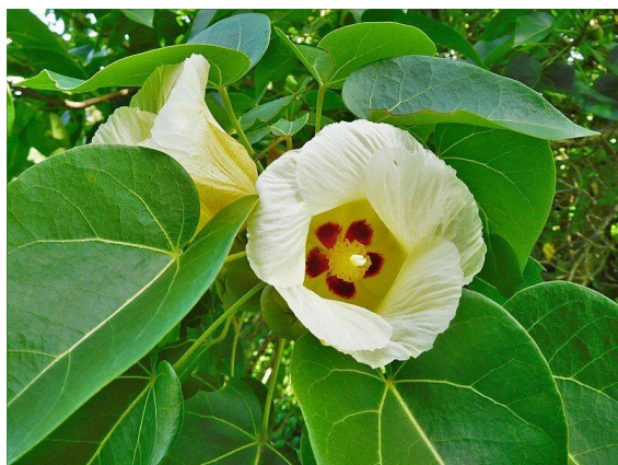
Fig. 12. Thespesia populnea

avoidance and elevated plus maze various learning and memory parameters are assessed. Bark of Thespesia populnea showed powerful memory enhancing activity in mice [43].