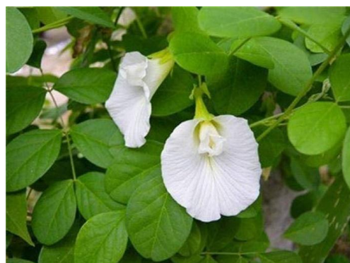
Fig. 3. Clitoria ternatea

Clitoria ternatea of Fabaceae family is commonly known as butterfly pea [29]. Dose of 100mg/kg of aqueous root extract when administer to young adult rat groups for 30 days period and to neonatal raised the content of Ach in hippocampus when compare to aged match control groups [30]. Increased content of Ach in hippocampus may also consider as a basis of neurochemical for their upgrade learning process and memory [31].