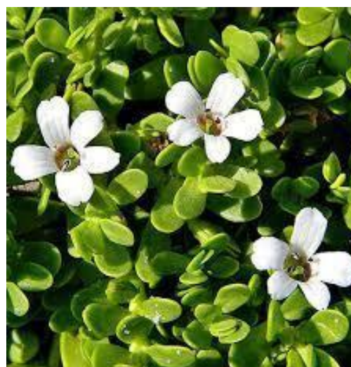
Fig. 7. Bacopa monnieri

Bacopa monnieri commonly called as brahmi is one of the members of the Scrophulariaceae family . This plant is known for its various therapeutics aspects such as memory enhancer, hepatoprotective, cognitive enhancer and tranquilizing effects. Presence of saponin triterpenoid which is also called as bacosides are responsible for memory enhancement [35].