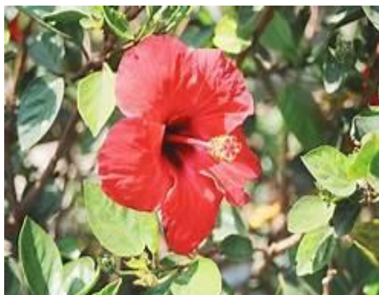
Fig. 13. Hibiscus sabdariffa

Aqueous extract of calyces of Hibiscus sabdariffa at 100 and 200 mg/kg showed nootropic activity in mice. As the latency transfer and increased step down latency are decreased in aged mice and in amnesic mice treated with scopolamine. Acetyl cholinesterase activity also decreased when compared with piracetam (200 mg/kg) [44].