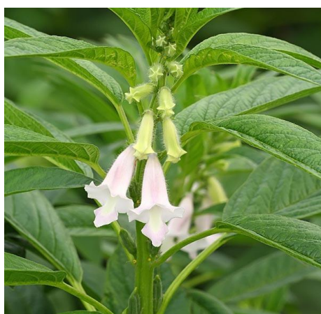
Fig. 5. Sesamum indicum

Sesamum indicum is also known as sesame belongs to Pedaliaceae family. Extensively distributed all around the world and is harvested for its palatable seeds that grows in shell. Some plentiful glycosides that are mostly found in Sesamum indicum are sesaminol glycosides which is a lignan glycosides that shows their presence in the seeds of sesame. The protective factor against Abeta-induced learning and memory deficits in morris water maze test was dietary sesaminol [33].