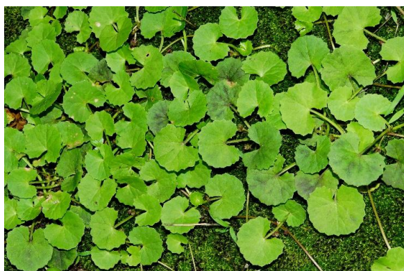
Fig. 1. Centella asiatica

Centella asiatica L. is a perennial plant commonly known as gotu kola belongs to Apiaceae family. This whole fresh plant is utilised as a cognitive enhancer for therapeutic purposes [23]. Centella asiatica is the herb that has the tendency to boost awareness interval, concentration, and revitalize peripheral nervous system and cerebrum. [24]. Centella asiatica hinders memory impairment induced by scopolamine through the inhibition of AChE [25].