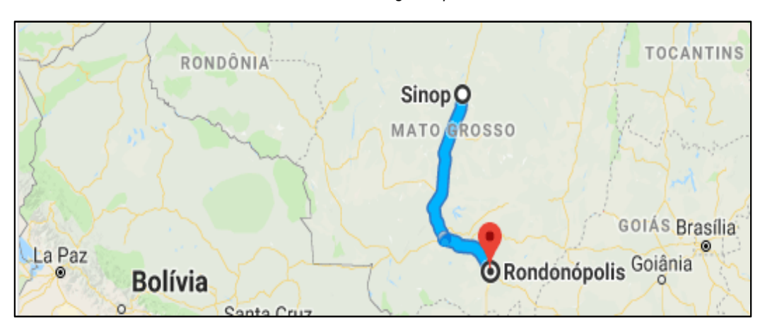
Fig. 1. Main route of maize flow in the State of Mato Grosso, BR 163/364, route from Sinop to Rondonópolis, Mato Grosso, Brasil.