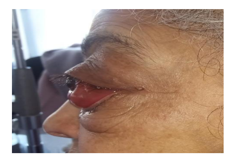
Fig. 1. Profile photograph of exophthalmos with inflammatory signs in the left eye

pathological Tumour biopsy and study showed the presence of T-type NHL. The extension work-up was negative and the lvmphoma was classified as stage Ι. followed Induction chemotherapy bν radiotherapy was indicated after patient consent.