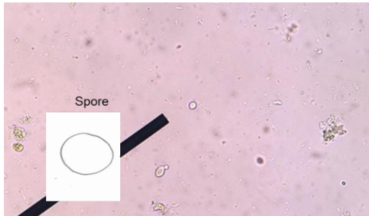
Fig. 1. Spora Candida sp.

(Source: results of microscopic examination of vaginal secretions tube no. 6 with 33 weeks of gestation)