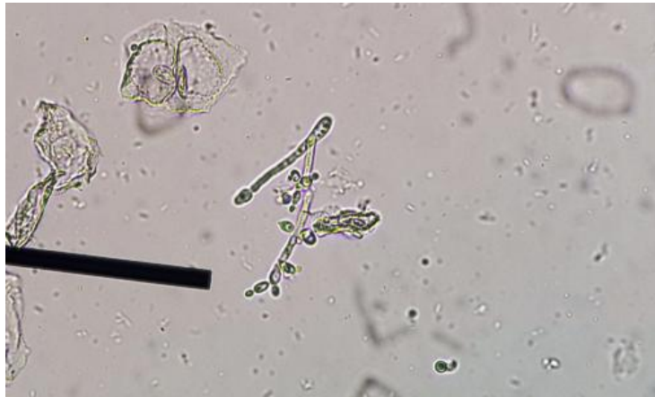
Fig. 4. Hifa semu Candida sp.