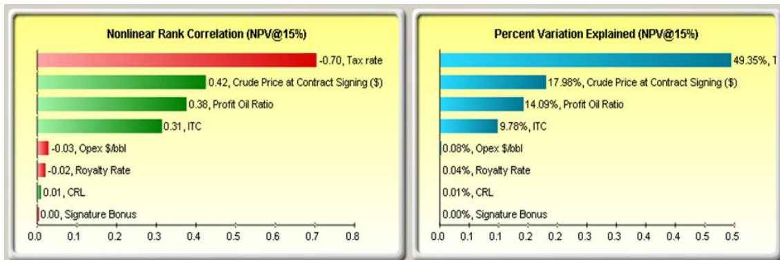
Fig. 1. Tornado and percentage variation on NPV

A similar analysis applied to %CT (Fig. 2), tax has the higher negative impact on the Contractor's Take, while Profit Oil and investment Tax Credit, has higher positive impact on the Contractor's Take. In addition, the percentage variation explained (Fig. 2), shows that 64.17% of the variation in %CT is accounted for by Tax, 28.91% by Profit Oil and 1.99% by ITC.