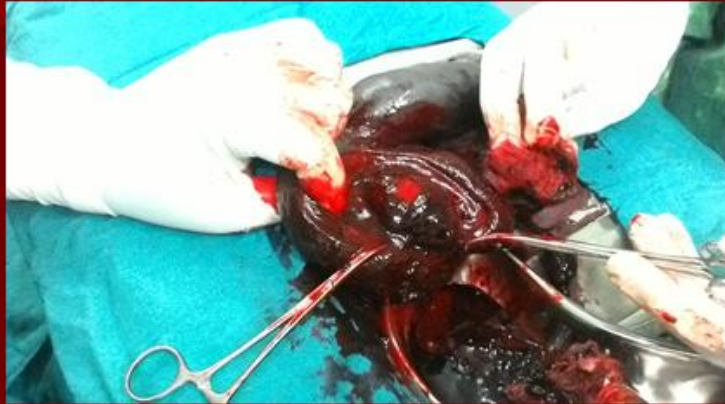
Fig. 5. Scrotal haematoma following 'wife abuse'