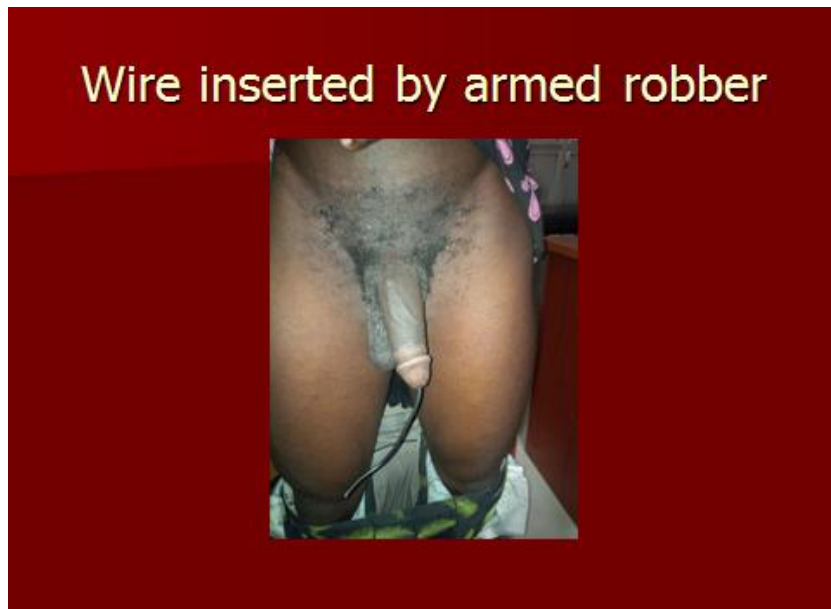
Fig. 4. Wire inserted into the urethra by armed robbers