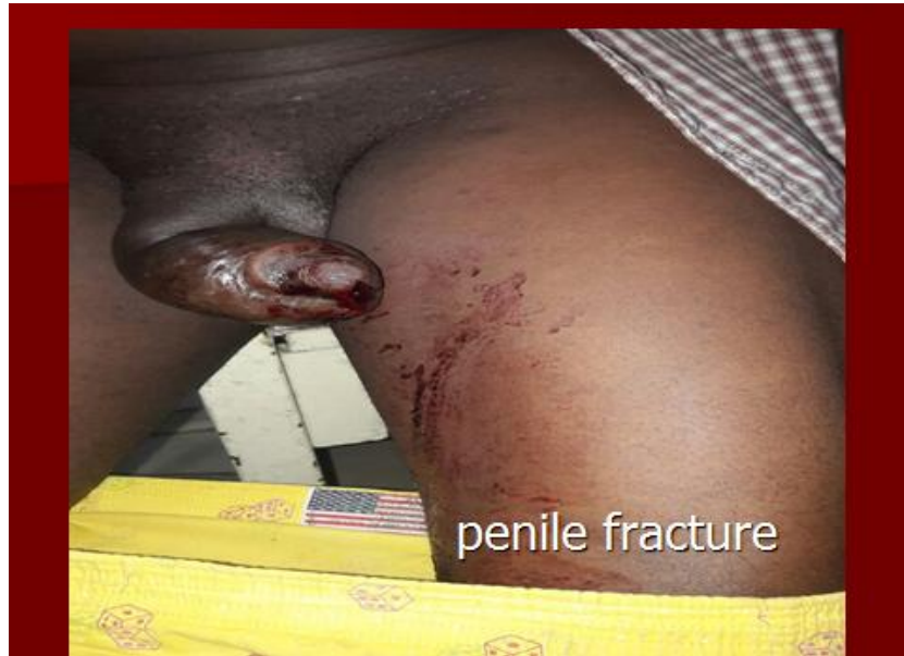
Fig. 3. Penile fracture