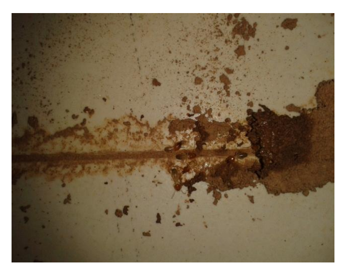
Fig. 4. Termite building termitorium on control sample

termiticides viz. Disodium Octaborate Tetrahydrate (DOT), Chlorpyriphos, etc. Excessive use of these chemicals is harmful for environment and the target insects develop resistance from the prolonged use of termiticides. Therefore, it is necessary to search for alternative means of termite control [12].