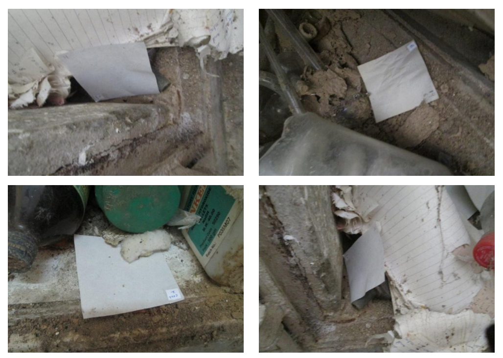
Fig. 3. Native termite-infested sites