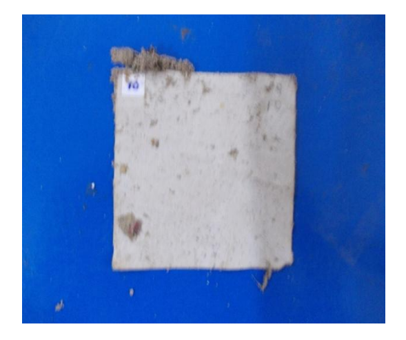
Fig. 8. 50% methanolic_non-polluted