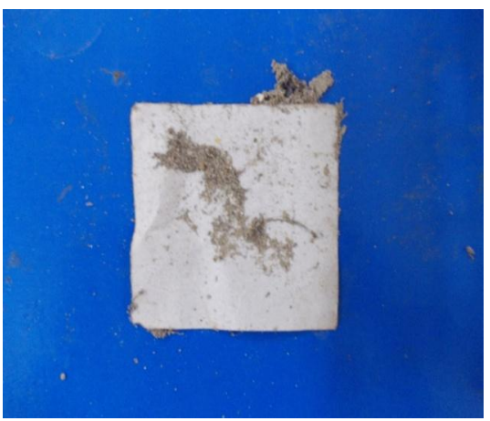
Fig. 9. 50% methanolic_polluted