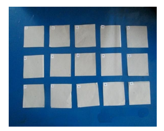
Fig. 2. Exprimental set

In total, 7 experimental sets were prepared according to Table 1. Each set was kept in replicates of 3. Untreated blotting paper was kept as a control. The experimental sets were then incubated to the selected sites and kept as such for 15 weeks. The experiment was observed at regular intervals of 2 weeks and photography was also done. Fig. 3 is showing native termite infested sites selected for the experiment. After 15 weeks, blotting papers were removed from the respective sites and weighed. Average weight loss and change % of weight loss was calculated.