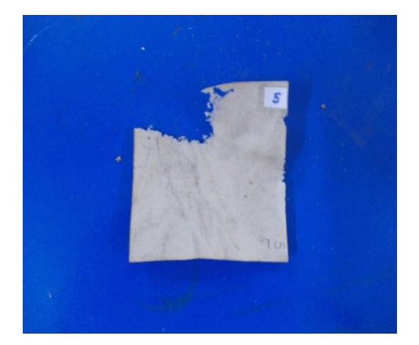
Fig. 6. Non-polluted aqueous extract