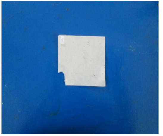
Fig. 7. Polluted aqueous extract