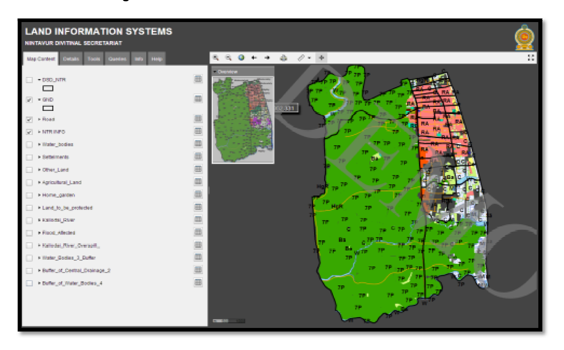
Fig. 3. Web GIS land information in Nintavur DSD

According to Land Information team members, all members can access the application but cannot update the latest information or change the geospatial information. Fig. 4 is a local information interface display for Land Monitoring in Web-based GIS Land Information.