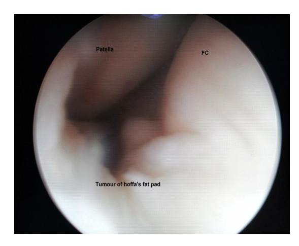
Fig. 3. Arthroscopic view of the Hoffa's tumour like