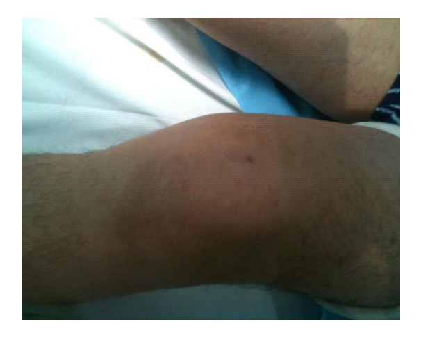
Fig. 1. Chronic kneepain, mild anterior swelling and mild loss of knee extension