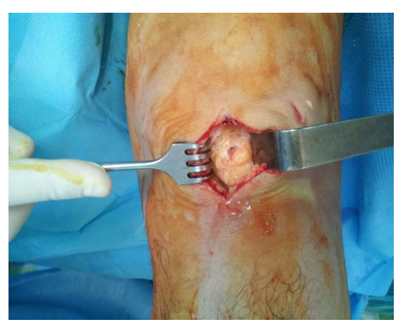
Fig. 4. Open resection of Hoffa's fat pad