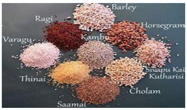
Fig. 1. Millets grown in India