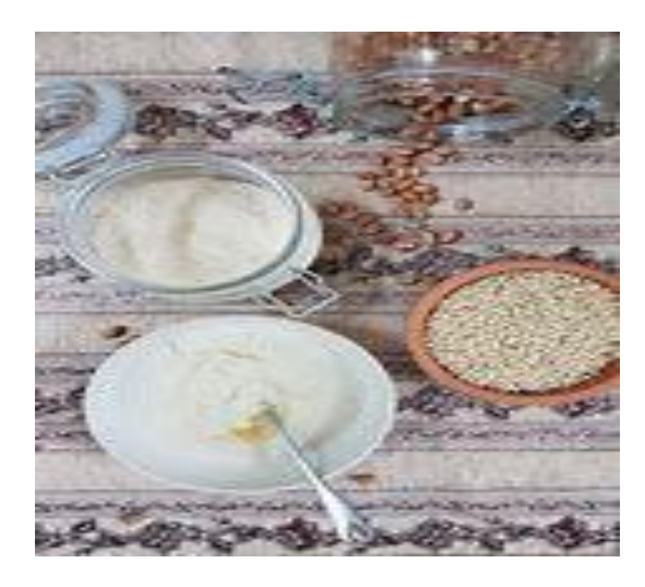
Fig. 2. Sorghum porridge

polyphenols, and proteins that fight healthrelated disorders/diseases. Several private and government agencies have invested huge amounts in millet production and their utilization for the formulation of different food products. The low glycemic index of millet helps manage diabetes, while its high fibre content aids digestion and prevents constipation.