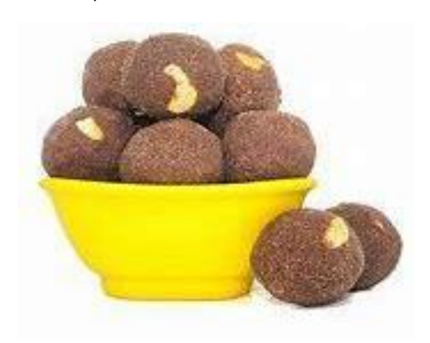
Fig. 5. Finger millet laddus