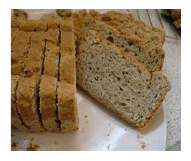
Fig. 3. Millet bread

Bread is made by mixing flour, water, oil, salt, and yeast into dough and baking it into a loaf. IIMR (Indian Institute of Millets Research) makes millet pieces of bread by replacing 50% wheat flour with pearl millet flour, finger millet flour, or foxtail millet flour of and adding the yeast, transfat free oil, salt, and sugar. Bread was prepared from proofed dough. Buns were prepared from dough balls (Fig 3).