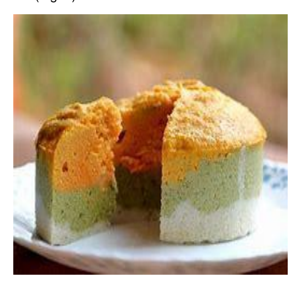
Fig. 4. Barnyard millet cake

are made with 100% pearl millet flour, finger millet flour, or foxtail millet flour, high-quality vegetable oil, sugar, eggs, and chocolate or vanilla essence. out of all, Finger millet cake was best (Fig. 4).