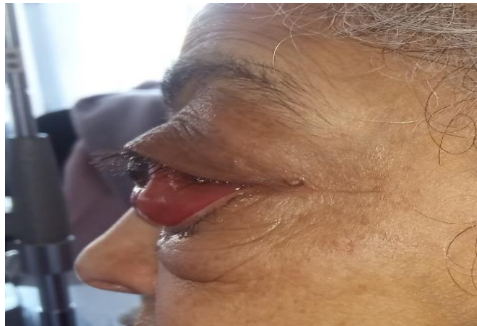
Fig. 1. Profile photograph of exophthalmos with inflammatory signs in the left eye

Tumour biopsy and pathological study showed the presence of T-type NHL. The extension work-up was negative and the lymphoma was classified as stage I. Induction chemotherapy followed by radiotherapy was indicated after patient consent.