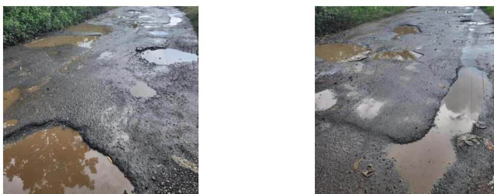
Fig. 1. Road condition on Raya District, Simalungun Regency