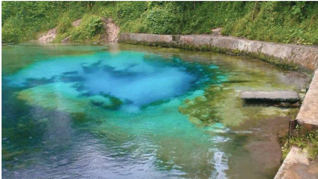
Fig. 2. Water condition and large water flow in Sungai Lobang