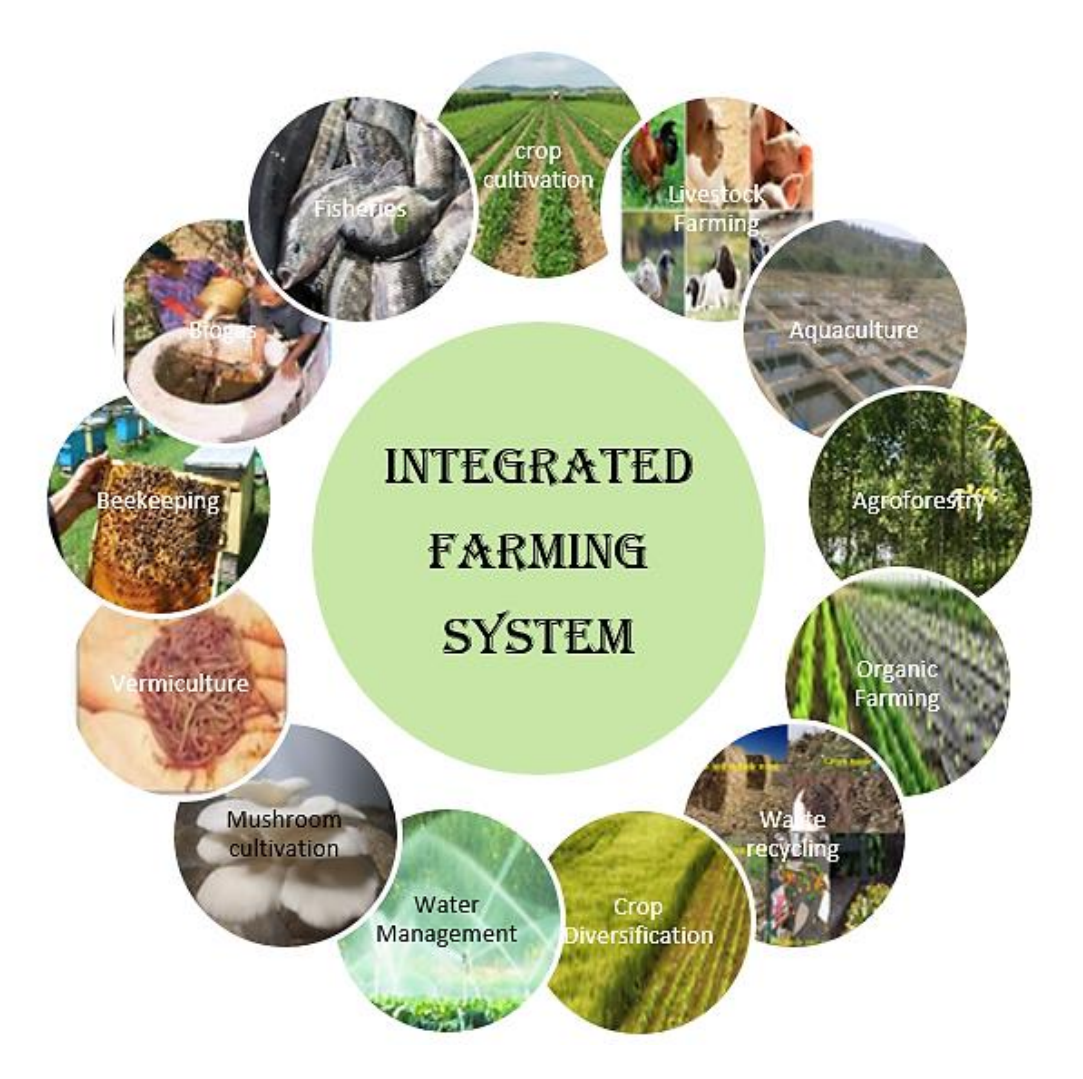
Fig. 1. Components of integrated farming system

Singh et al.; Int. J. Plant Soil Sci., vol. 36, no. 9, pp. 641-649, 2024; Article no.IJPSS.123470