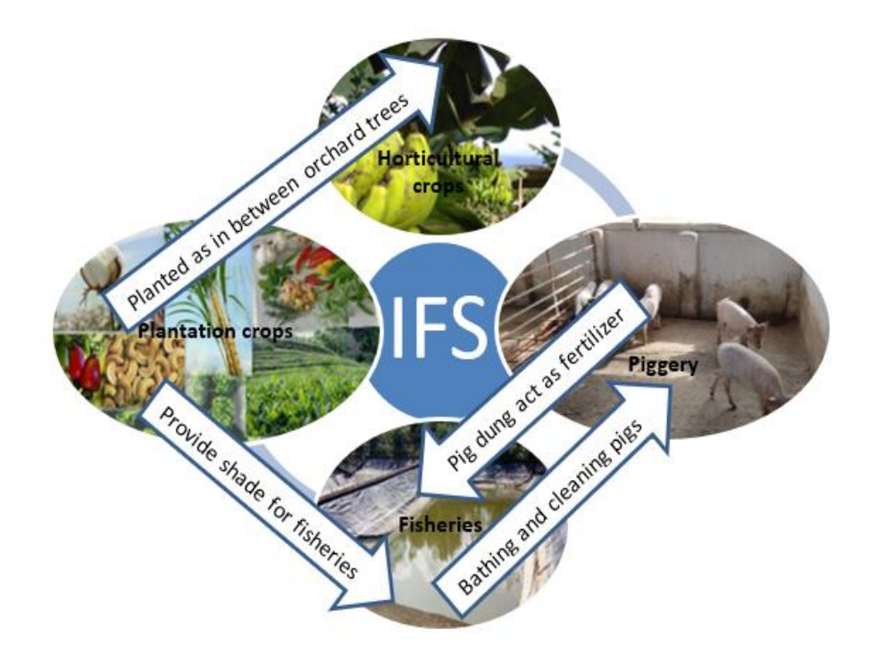
Fig. 2. Model of horticulture, piggery, fisheries and plantation crops

Singh et al.; Int. J. Plant Soil Sci., vol. 36, no. 9, pp. 641-649, 2024; Article no.IJPSS.123470