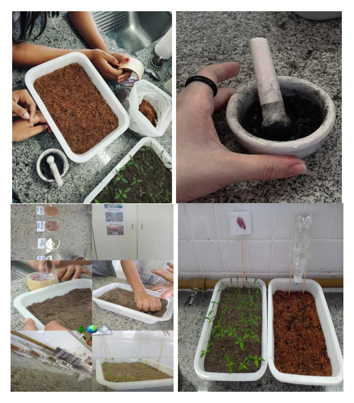
Fig. 2. Agricultural soils

involved in planting and caring for the plants fostered sense of community and а cooperationessential skills for their future professional endeavors. Practical activities like these increase student engagement, resulting in more meaningful and learning lasting experiences.