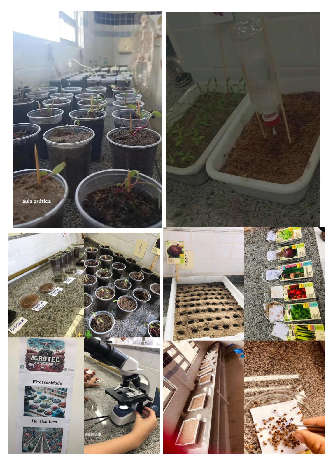
Fig. 3. Horticulture and vegetable cultivation Source: Students and the professor and coordinator of the Technical Course in Agriculture at ECIT Riachão do Poço, PB, Brazil.