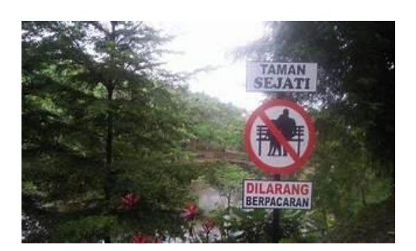
Fig. 1c. True Garden

Sujalu et al.; Asian J. Res. Agric. Forestry, vol. 10, no. 4, pp. 321-327, 2024; Article no.AJRAF.125854