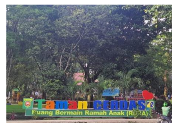
Fig. 1b. Smart Garden