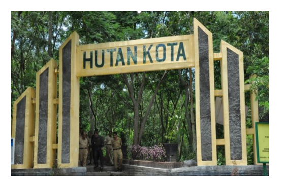
Fig. 1d. Urban Forest