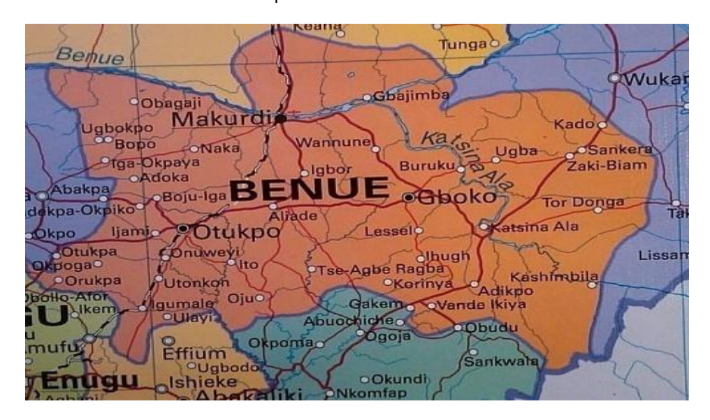
Fig. 1. Map of Benue State

Benue State falls within longitude 7^{0}47^{1} , 10^{0}0E and latitude 6^{0}25^{1} , 8^{0}8^{1}N , the State shares boundaries with five other states in Nigeria. It share boundary with Nasarawa State to the North, Taraba State to the East,