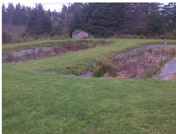
Figure 1. Two constructed wetlands located at Dalhousie University's Constructed Treatment Wetland Research Site in Bible Hill, NS before renovation in 2013 (after almost 14 years of operation)

Note. *FC were measured in CFU 100 mL -1 .