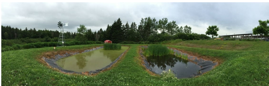
Figure 4. Photo of the two constructed wetland systems, without aeration (left) and with aeration (right)

Artificial aeration in CWs have been found to increase their nutrient removal capabilities, especially in cold climates. Although oxygen solubility is increased during colder weather, the dormancy of local plant life often creates a low oxygen environment causing low levels of organic matter decomposition (Ouellet-Plamondon et al., 2006). To combat this, many CWs use artificial aeration methods to help maintain an aerobic environment. Figure 4 demonstrates the visual differences between wetlands with and without aeration under peak flow periods. In the CW lacking aeration, there is layer of algae present suggesting an overloading of nutrients.