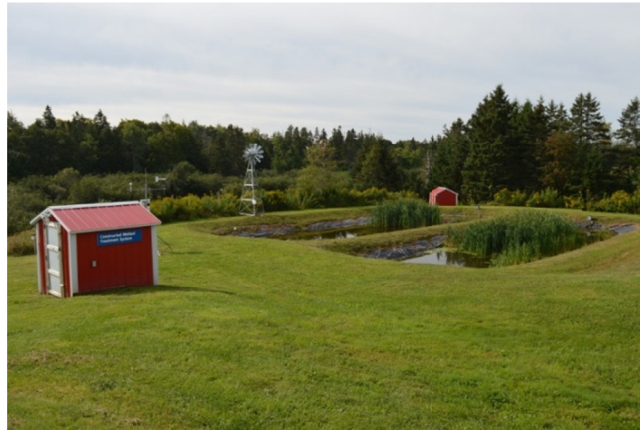
Figure 3. Newly renovated wetland systems at Dalhousie University Constructed Wetland Treatment Research Site, Bible Hill, NS after renovation in 2014. A windmill was included for aeration purposes

overall performance was when evapotranspiration rates were high and precipitation was low. The lack of water resulted in very little outflow, hence resulting in vegetation growing at a faster rate, primarily weeds, grasses and cattails, which contributed to short-circuiting throughout the wetlands. Contrary, when there were heavy rainfall periods, the wetlands were diluted, but mass removal calculations reported in this study accounted for this dilution effect. When wind speeds increased the on-site 4.9 m windmill increased overall aeration enhancing overall treatment by up to 20% (Figure 3).