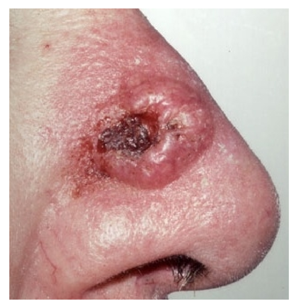
Fig. 1. Nodular or noduloulcerative basal cell carcinoma, the most common type, showing central ulceration

The Nodular BCCs typically present on the face as a pink colored papule as shown in Fig 1. It represents about 60 percent of cases. The lesion usually appears as pearly or translucent and a telangiectatic vessel is frequently seen within the papule. Frequent ulceration are seen therefore the term "rodent ulcer" refers to these ulcerated nodular BCCs. Nodular basal cell carcinoma is shown in.