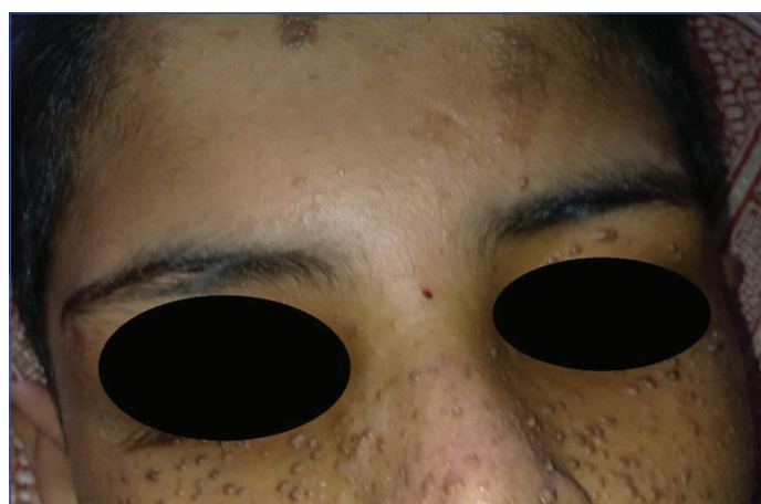
[Table/Fig-4]: Clinical picture of 15-year-old female Case 4 face with multiple angiofibroma (adenoma sebaceum) sparing the forehead with one forehead plaque.

of face showed multiple angiofibromas suggestive of adenoma sebaceum sparing the forehead and a forehead plaque [Table/Fig-4]. In the present case cutaneous ash-leaf macule or any other skin marker was not detected on Wood's lamp examination. Fundoscopy revealed retinal mulberry tumour. Vision was normal. EEG showed hypsarrhythmia. MRI showed multiple subependymal nodules and cortical tubers, however, there was no ventriculomegaly. Echocardiography did not reveal any cardiac mass. Renal ultrasound was also normal. The diagnosis of TSC was established by the presence of five major criteria's like facial angiofibroma (adenoma sebaceum), forehead plaque, MRI showing subependymal nodules with cortical tubers and retinal nodular hamartoma. Seizures were controlled with vigabatrin. The child was started on vigabatrin at the dose of 50 mg/kg/day in two divided doses. Seizures were not well-controlled at this dose, so, the dose had to be escalated to 75 mg/kg/day after two weeks and advised to continue it for six months and be under strict follow-up with paediatric neurologist.