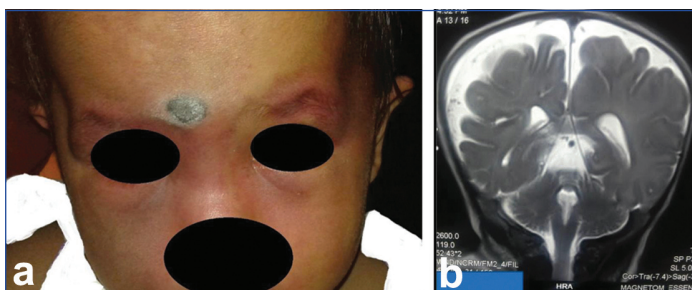
[Table/Fig-6]: a) Clinical picture of nine-month-old female Case 6 with reddish-blue discolouration of skin involving right half of face suggestive of port-wine stain present since birth, b) MRI brain of above child Case 6 showing right cerebral hemiatrophy, hypertrophied choroids plexuses, left parieto-occipital gliosis with marked leptomeningeal enhancement along left parieto-occipital gyri.

A 9-month-old female child presented with developmental delay and reddish blue discolouration of skin involving right half of face, right hand and right leg. There was also mild hypertrophy of the right leg compared to the left [Table/Fig-6a]. Ophthalmological examination revealed glaucoma in the right eye. MRI of brain showed right cerebral hemiatrophy, hypertrophied choroids plexuses, left parieto-occipital gliosis with marked leptomeningeal enhancement along left parieto-occipital gyri [Table/Fig-6b]. The child was started on antiglaucoma medications and prophylactic anticovulsant. The child was also started on propranolol 1 mg/kg/day. A few months later the child came to emergency with intractable seizures mostly involving left half of body followed by left-sided hemiparesis, but the skin lesions had become fainter and were regressing. In this case the diagnosis of SWS (Type I Roach scale) was made based on the constellation of symptoms and signs of capillary malformation in the face (port-wine stain) and brain abnormalities (leptomeningeal) and glaucoma [4,7]. Parents were counselled regarding the prognosis and kept on follow-up with antiepileptic medications.