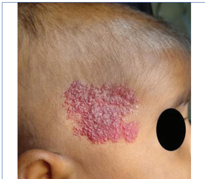
[Table/Fig-2]: Clinical photograph of child with strawberry haemangioma over right ophthalmic dermatome (V1) of trigeminal nerve with raised Intraocular Pressure (IOP) of right eye.

abdomen was done which revealed no haemangioma, elsewhere. Oral propranolol was started at a dose of 1 mg/kg/day and skin lesion significantly regressed in size after three months. The child is currently under ophthalmological follow-up.