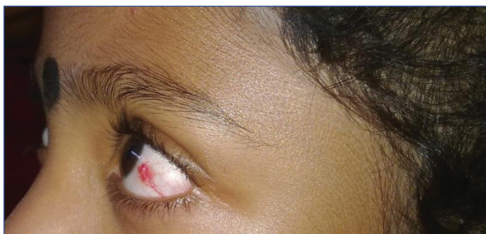
[Table/Fig-5]: Clinical picture of 7-year-old female Case 5 with left eye telangiectasia over sclera.

more than normal), when she wanted to look at the sides. There was a telangiectatic lesion on left eye which mother noticed for last two years. Ophthalmologists confirmed that there was telangiectasia over sclera with oculomotor apraxia [Table/Fig-5]. Fundal examination was normal. MRI brain showed white matter signal changes in lower brain stem and cervical cord suggestive of degenerative ataxia. The diagnosis of ataxia-telangiectasia was made based on gait ataxia, ocular telangiectasia and MRI findings of white matter changes in brain [6]. Suspecting ataxia-telangiectasia serum Immunoglobulin A (IgA) level and Alpha Fetoprotein (AFP) estimation revealed low serum IgA level and very high AFP levels. So, a diagnosis of Ataxia Telangiectasia was made and genetic test was advised. Parents were counselled and the child was advised to avoid unnecessary exposure to ionising radiation (X-ray, CT scan).