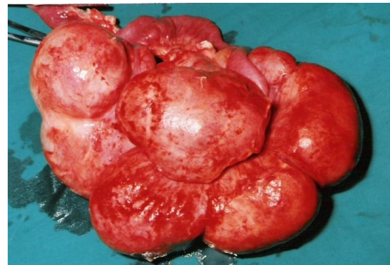
Fig. 4. Showing a huge chylolymphatic multicystic mass of size 15x12x10 cm & weight 1.5 kg

Type 1- Pedicel mesenteric cystic lymphangioma can cause intestinal volvulus and torsion.