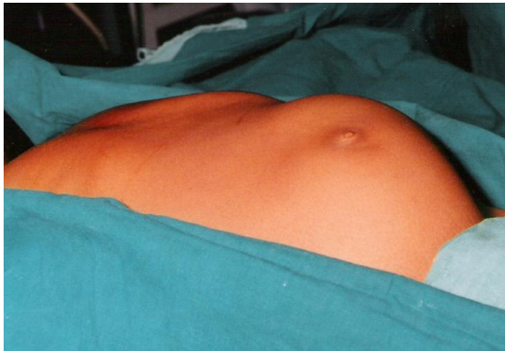
Fig. 1. A palpable lump in abdomen occupying suprapubic, umbilical and epigastric region of lump size 10x8 cm