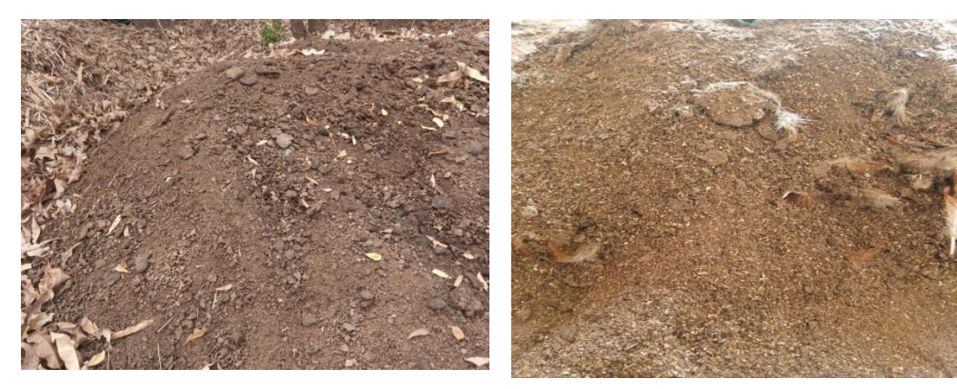
Table 2. Chemical characteristics of the organic substrates used