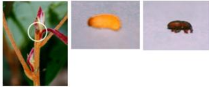
Fig. 3. Attacked seedling, larva, and the sprout borer