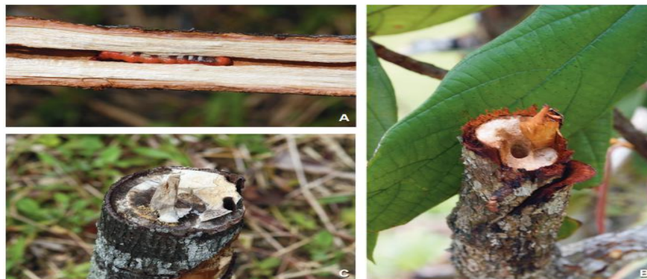
Fig 1. Formation of galleries (A, B) and girdling in the trunk (C) of cupuazu tree caused by the cupuazu tree branch borer

The cupuaçu fruit borer ( Conotrachelus humeropictus ) (Coleoptera: Curculionidae) has been the worst pest of the crop. The larva of this insect develops inside the fruit and then goes to the ground, where the pupa period passes, and then the adults emerge [18].