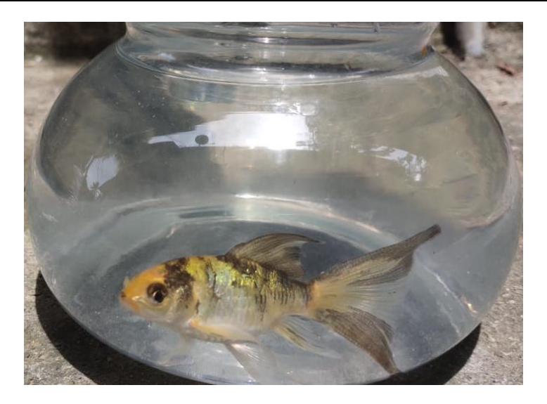
Plate 1. Experimental fish -Koi carp (Cyprinus rubrofuscus)