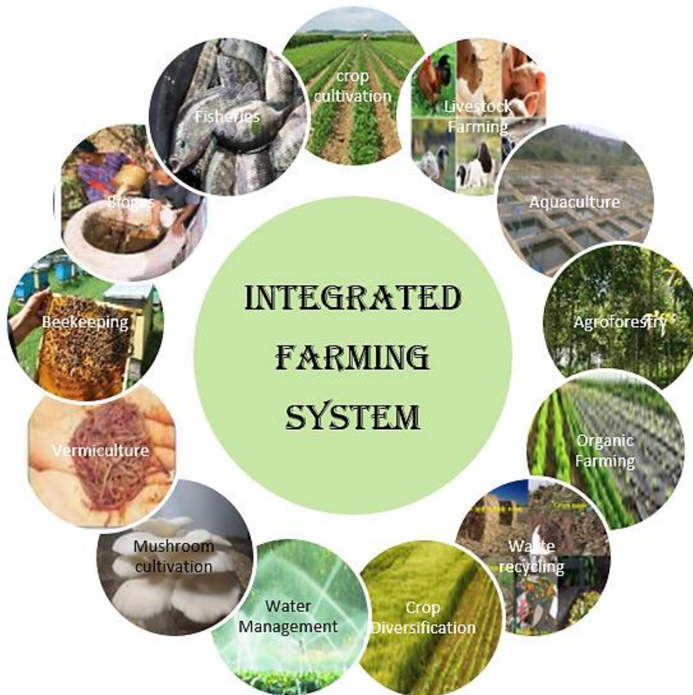
Fig. 1. Components of integrated farming system

Overall, the different components of IFS are integrated in a way that maximizes the efficient use of resources and minimizes negative environmental impacts. The integration of different components provides a range of benefits such as diversification of income sources, improved soil fertility, and increased food security.