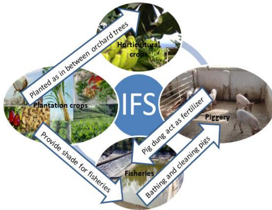
Fig. 2. Model of horticulture, piggery, fisheries and plantation crops