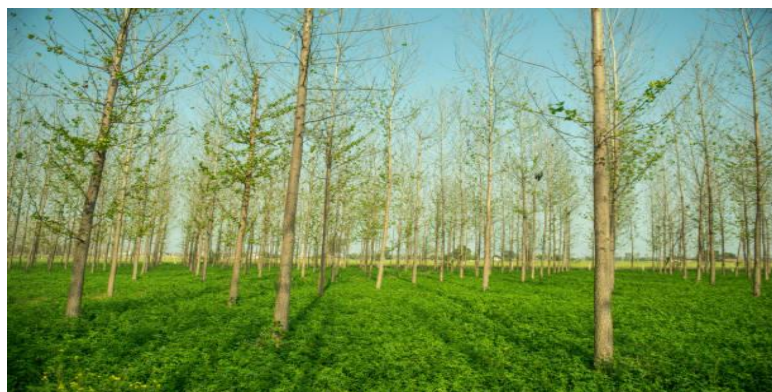
Fig. 1. Agroforestry significance in combating climate change

systems, which increase soil organic matter. Additionally, less reliance on chemical pesticides and fertilizers can result from varied cropping systems, which will lessen overall emissions from agricultural activities (Jose, 2009). Agroforestry increases soil quality, increases water retention, and decreases erosion to improve resistance to climate unpredictability. Trees may produce microclimates, buffer harsh temperatures, and give livestock and crops shade. Increased ecological stability brought about by diverse plantings makes agricultural systems more resilient to pests and diseases. An increased frequency of extreme weather events and rising global temperatures necessitate the use of adaptable agriculture practices. Reports from the Intergovernmental Panel on Climate Change (IPCC) show that there are growing threats to food security, especially in weaker areas. Agroforestry presents a viable approach that is in line with international initiatives to cut carbon emissions and prepare for the effects of climate change. The necessity of sustainable land-use techniques is being acknowledged by nations across the globe, and agroforestry is becoming more popular as one of these tactics.