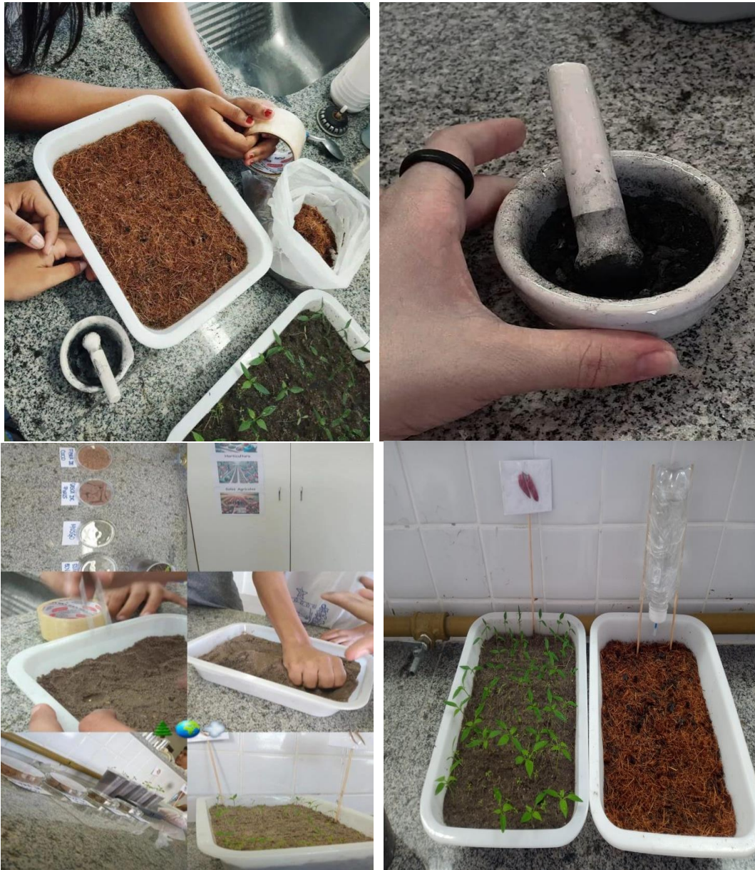
Fig. 2. Agricultural soils

Source: Students and the professor and coordinator of the Technical Course in Agriculture at ECIT Riachão do Poço, PB, Brazil.