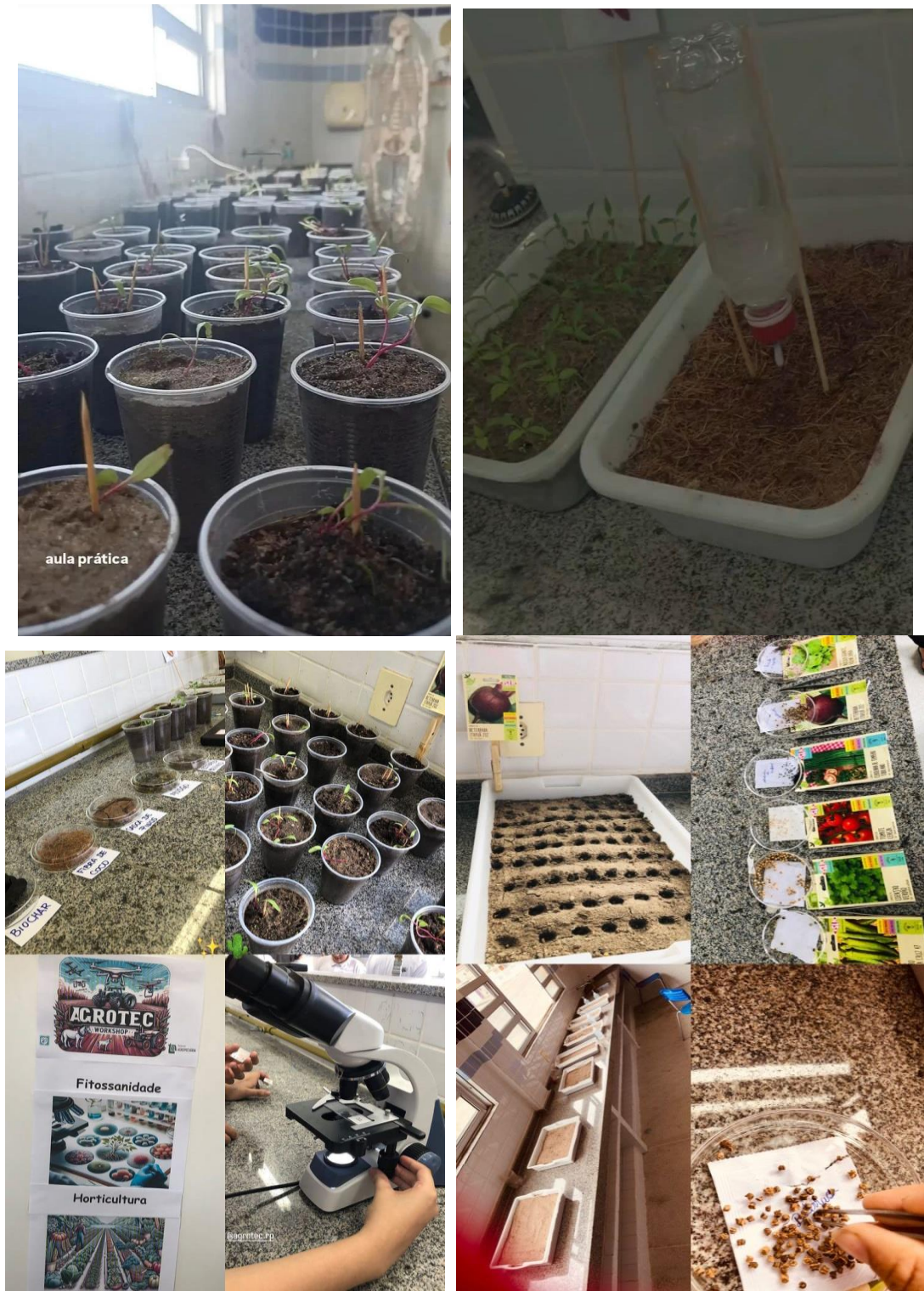
Fig. 3. Horticulture and vegetable cultivation

Source: Students and the professor and coordinator of the Technical Course in Agriculture at ECIT Riachão do Poço, PB, Brazil.