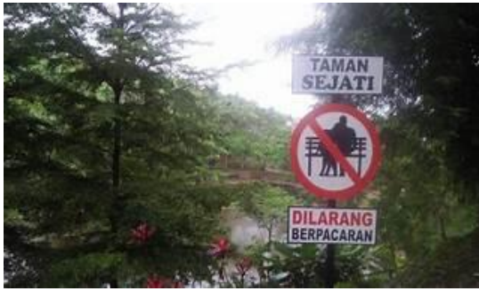
Fig. 1c. True Garden