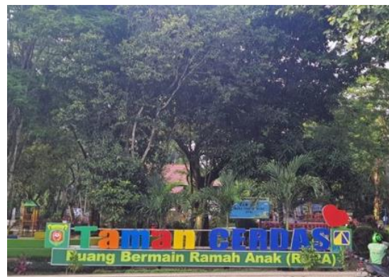
Fig. 1b. Smart Garden