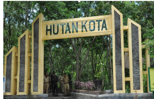
Fig. 1d. Urban Forest