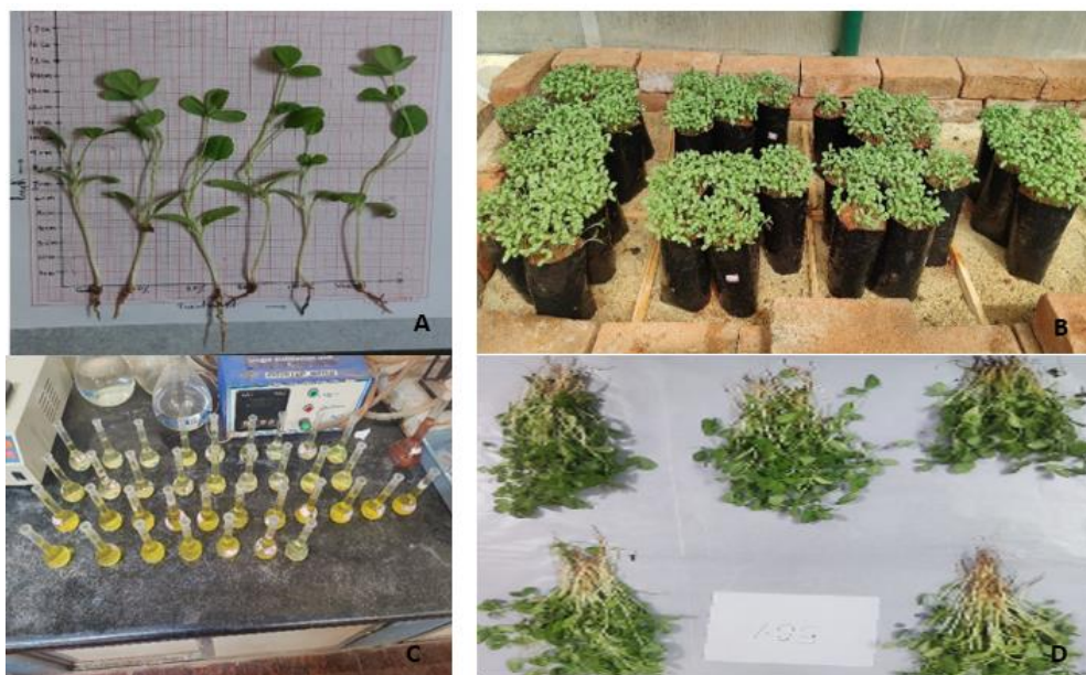
Fig. 3. A. Germinated T. foenum seedlings after 4 weeks period; B. Growth of T. foenum in different concentrations of bat guano after 4 weeks period; C. Soil sample analysis; D. T. foenum plant samples before NPK analysis