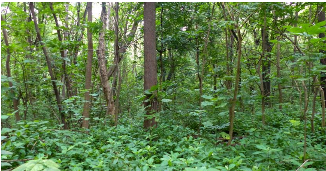
Fig. 1. Amendment (Bat Guano) collection site in forest area of Institute of Wood Science and Technology, Bangalore

To assess the impact of bat guano on fenugreek seed germination and seedling growth, seeds were pre-soaked overnight in water and sowed in different treatments for germination. Potting mixture consists of autoclaved red soil and river sand (1:1) was mixed with guano in different ratios in polybags. The treatments included: T1- autoclaved soil + 10% bat guano; T2- autoclaved soil + 20% bat guano; T3- autoclaved soil + 50% bat guano; T4- autoclaved soil+ 100% bat guano; T5- vermicompost; T6- autoclaved soil (control) respectively. All the treatments were taken in triplicates. The polybags were watered (sterile water) twice a day until harvest (4 weeks). Germination percentage was recorded at the end of four weeks period. On uprooting the seedlings shoot length and number of leaves were determined.