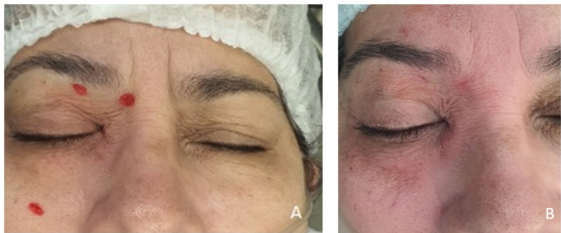
Figure 2. (A) An hydrophilic pen utilized to identify surface anatomy marks, from superior to inferior, supraorbital notch, supero-medial orbital angle and infraorbital foramen; (B) Main final aspect after the blockage.