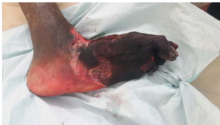
Figure 5. Ischemic foot.