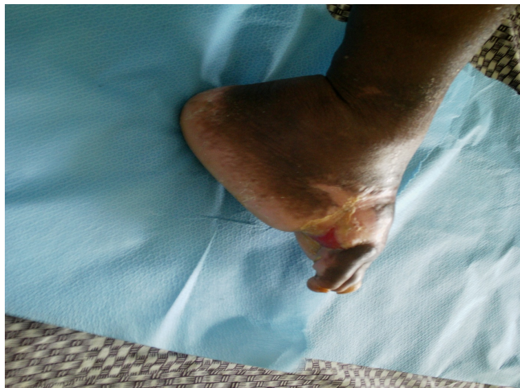
Figure 1. Charcot neuroarthropathy.