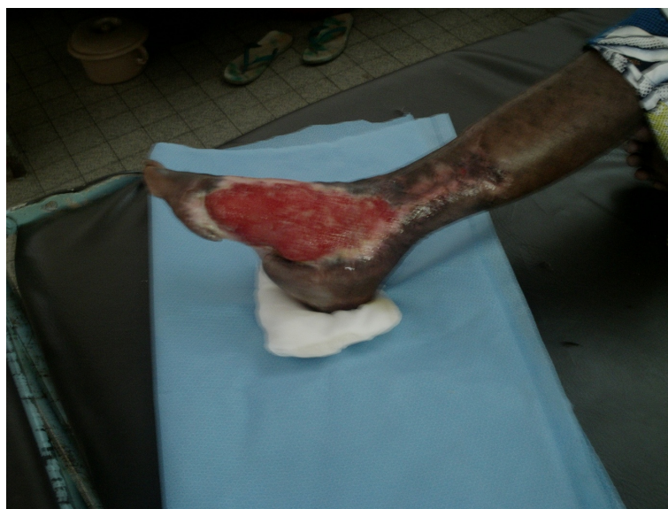
Figure 2. Diabetic foot infection.