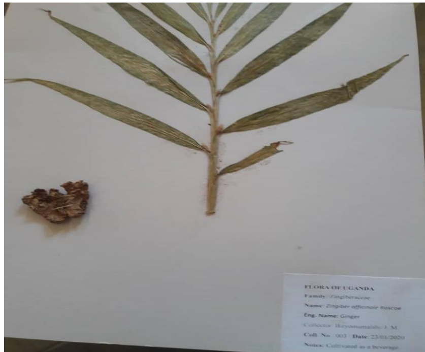
Fig. 3. Zingiber officinale Roscoe herbarium specimen