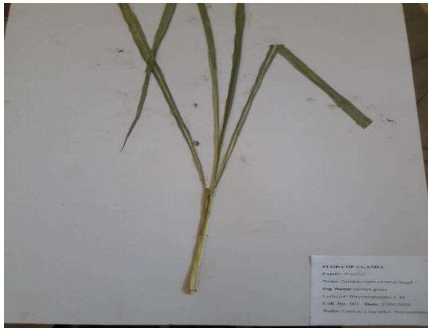
Fig. 1. Cymbopogon citratus (DC.) Stapf herbarium specimen

Data are expressed as mean ± SEM, n=9, a , **and *P<0.05 is considered significant