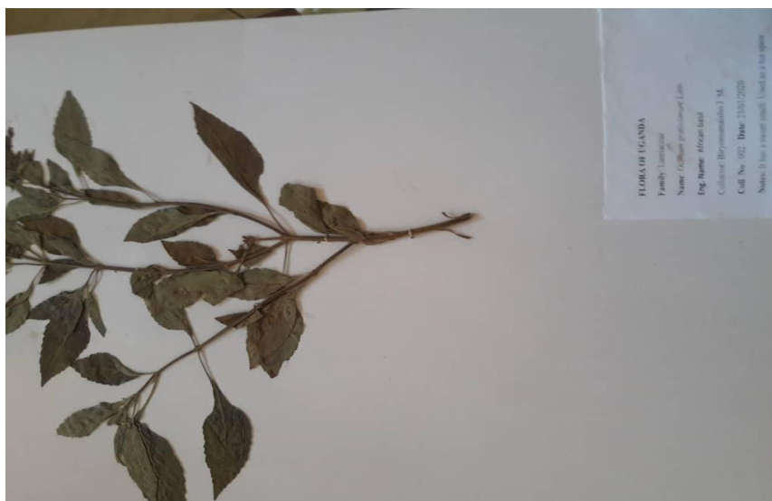
Fig. 2. Ocimum gratissimum L. herbarium specimen